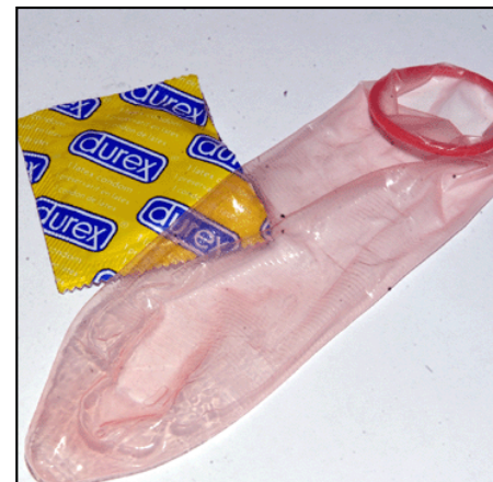
[ click for fullsize ] Peter Dunn | Cavalier Daily ( more ) Durex Extra Feeling